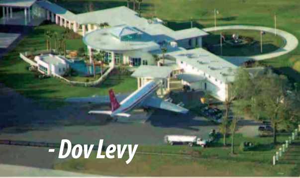
- Dov Levy